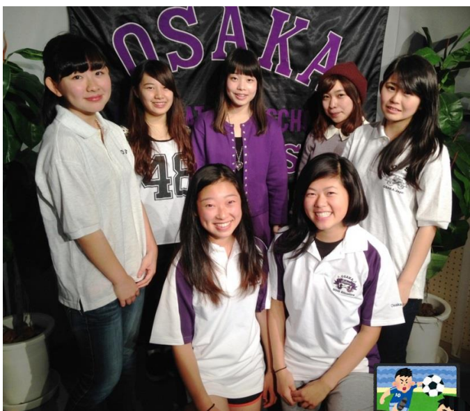
Sabers TV personalities and crew 2015-16