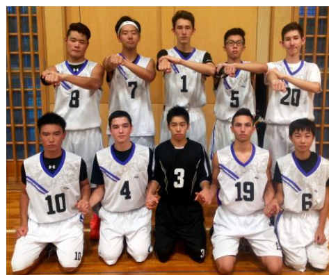
SOIS boys volleyball 2015

As always, thank you for your continued support of the Sabers activities program. Please contact the AD any time you need help. Please visit the AD office, room A-240, near the business office. Contact at pheimer@senri.ed.jp or at 072-727-2137.